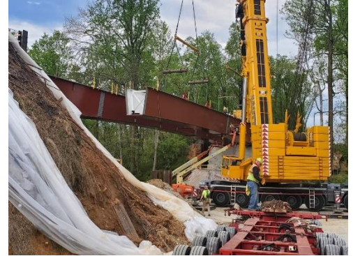
Tub girders set for a light rail crossing in Rock Creek, Md.

Previous page, L-R: the crew sets a spandrel for the Oxford Parking Garage, Oxford, Pa.; curved girders for the Purple Line transit project in Silver Spring, Md.; girders connected over active rail lines at Silver Spring Station in Maryland.