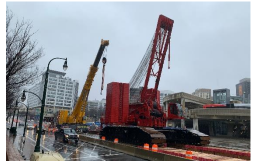
A 600-ton crawler crane ready to lift girder sections over an active rail line and highway.