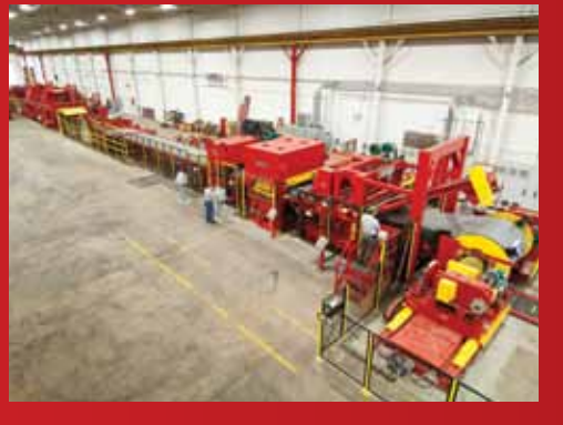
High Industries is made up of affiliated companies that serve construction and manufacturing markets.

Top: A plate girder bridge is erected for the Virginia I-495 HOT Lanes project. Located in the Washington, D.C. Capital Beltway, the project totaled over 21,500 tons of steel fabricated and erected by High Steel Structures; High Transit shipped the job. Bottom Left: Cantilevers featured in the four-story, 683-space precast concrete parking garage built by High Concrete Group for the Philadelphia Zoo, in Philadelphia, Pennsylvania. Bottom Right: High Steel Service Center's HIGH SL ® processing line comprises a Bradbury Group eDrive® roller leveler, a Bradbury heavy-gauge roller leveler, and a Red Bud Industries® stretcher leveler to provide panel-flat carbon steel that is 100 percent stress-free.